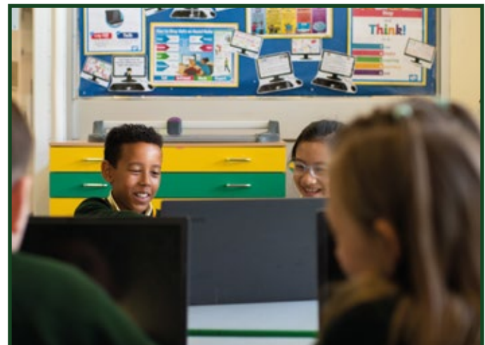
'As unique individuals, we do our best at work and play for the love of God and others.'

We have many talented musicians at St Benedict's and are proud of our school band ('The Elastic Band') who perform in assemblies, at church and at the Wilmslow Music Festival. We have an excellent school choir who sing at Mass each month and have taken part in Rotary events and the Cheshire Show. We offer after school music clubs including keyboard, ukulele, guitar and recorders. Our curriculum time music lessons are bolstered by music specialists and year 5 perform with the Hálle Orchestra.