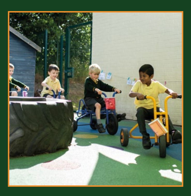
'As unique individuals, we do our best at work and play for the love of God and others.'