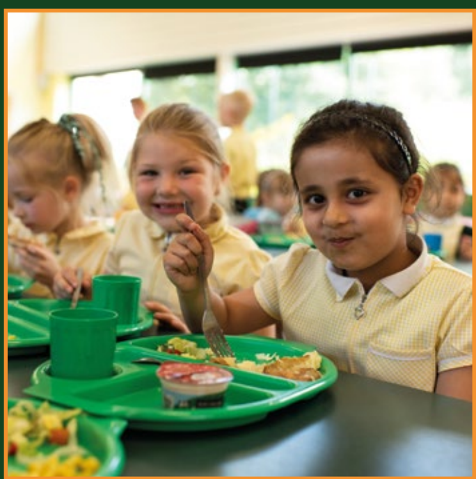
'As unique individuals, we do our best at work and play for the love of God and others.'