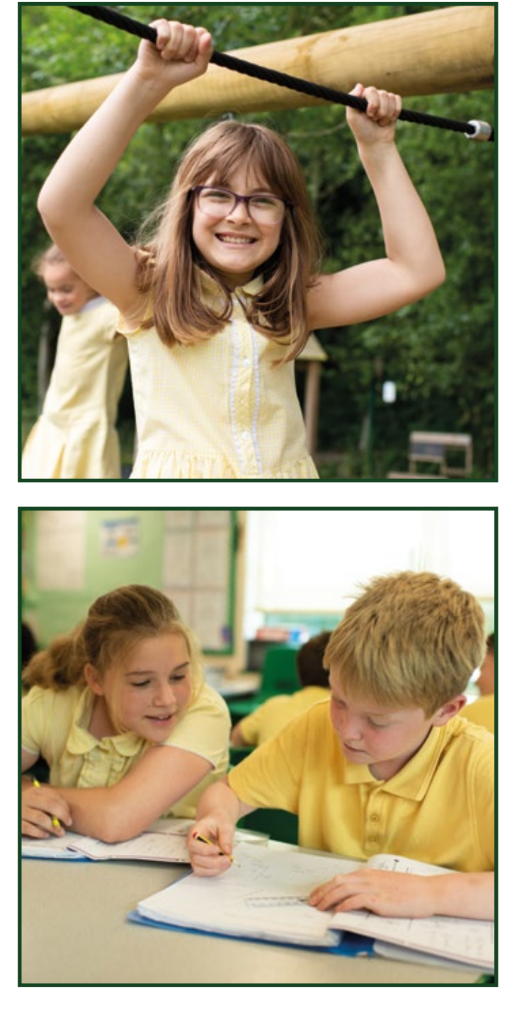
'As unique individuals, we do our best at work and play for the love of God and others.'